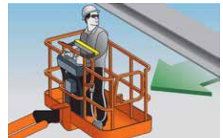
The auto reverse feature activates for most functions (see chart).