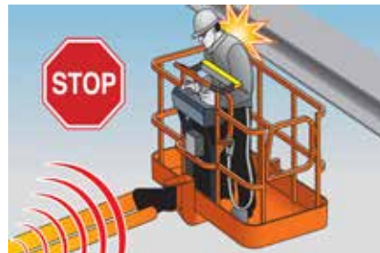
Horn sounds upon operator contact with the bar.