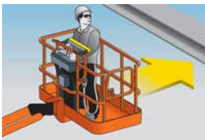
Operator moves toward obstruction.