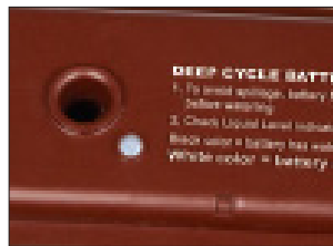
Water Indicator Signal