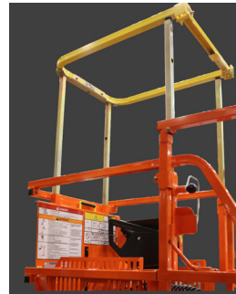
INTEGRATED MID-RAIL DECK KIT