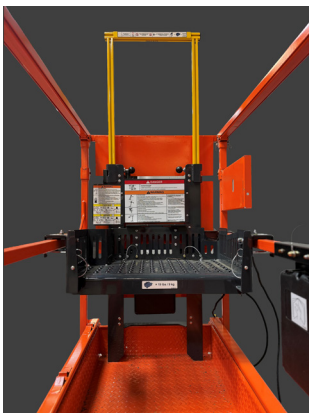
MID-RAIL DECK KIT